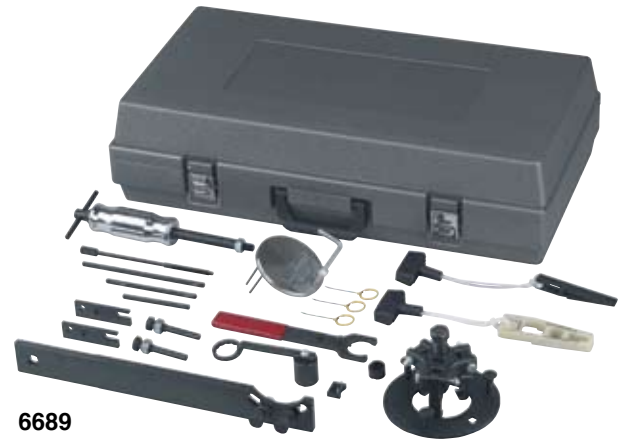
Chrysler / Jeep Cam Tool application chart for 6689 Note: Some applications require more than one tool to accomplish the task.

No. 6689 – Chrysler/Jeep cam tool set. Wt., 25 lbs.